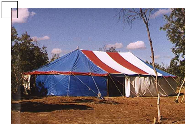
The Old Chapel Tent: