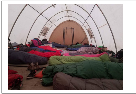
A full house