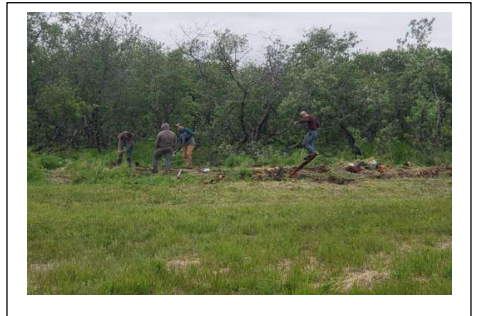
Preparing for new dorm cabin