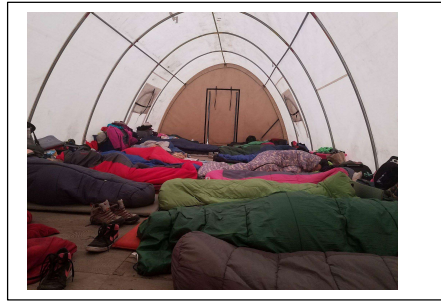
A full house