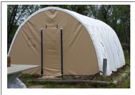
One of four present dorms